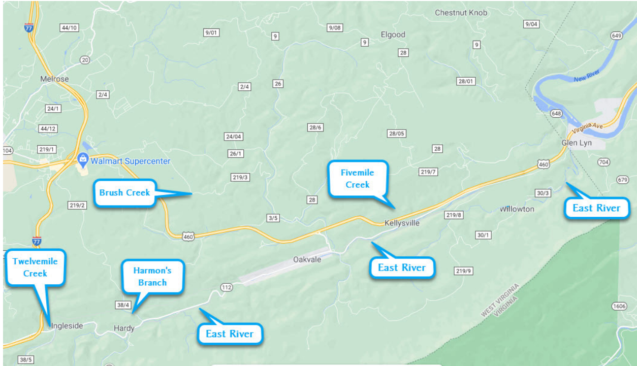
Map 3 Northwest Giles: East River from Twelve-Mile Creek Westward to Big Springs & Mills Valley